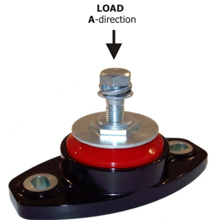
Model: M80-16B(60) shown

Dimensions in millimetres (mm.) - unless stated otherwise