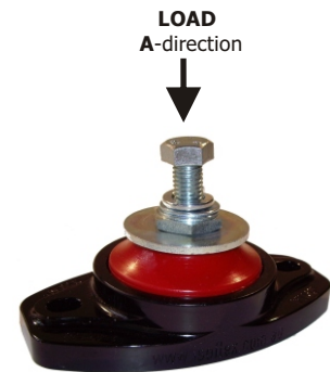
Model Number: M50-12B(60) shown

Drawing number: DSA-M50-12B Drawn: PB Date: 14-9-06