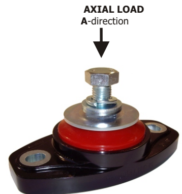
Model Number: M130-24B illustrated

Note: the bolt length required is dependent on the application, a standard length bolt is supplied. Allow a minimum of 1x bolt dia & maximum of 1.5x bolt dia into the mount. 2x flat washers & 1x spring washer supplied, ensure that they are fitted as shown.