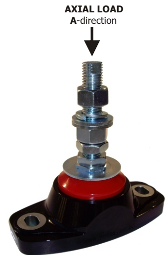
Model Number: M110-24S(60) illustrated

Dimensions in millimetres (mm.) - unless stated otherwise