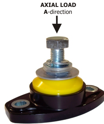
Model Number: M100-24B illustrated

Note: the bolt length required is dependent on the application, a standard length bolt is supplied. Allow a minimum of 1x bolt dia & maximum of 1.5x bolt dia into the mount. 2x 50dia x 4 thick flat washers & 1x spring washer supplied, ensure that they are fitted as shown.